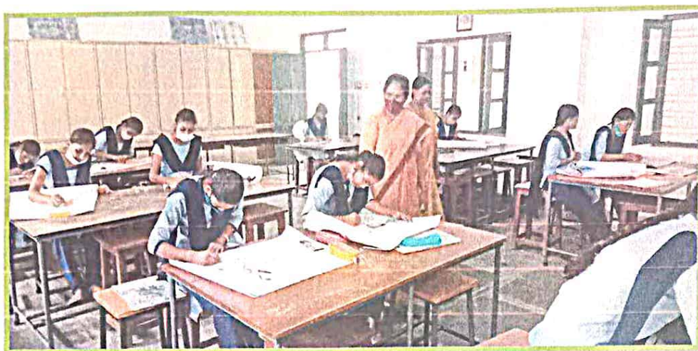
Intra Collegiate Competition on Drawing in College Botany Lab

An Intra Collegiate Competition on Drawing was conducted on 18 th November 2022 on RRR (Reduce - Reuse – Recycle) Model of Waste material and Short Film and Advertising Film on Solid Waste Management, Sanitation and Cleanliness was taken place from 18 November 2022 to 21 November 2022.