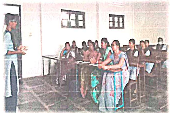
Essay Writing & Elocution Competition- Solid Waste Management